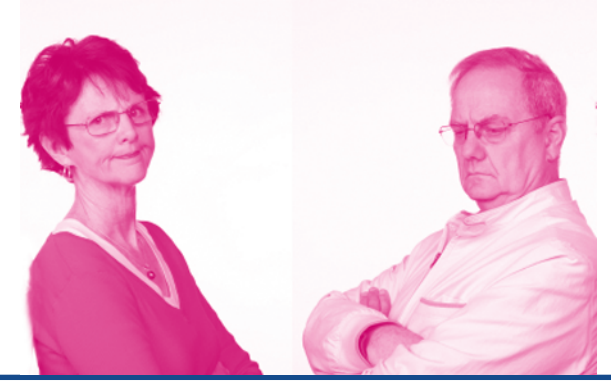
This newsletter is intended to offer general information only and recognizes that individual issues may differ from these broad guidelines. Personal issues should be addressed within a therapeutic context with a professional familiar with the details of the problems. ©2011 Simmonds Publications: 5580 La Jolla Blvd., #306, La Jolla, CA 92037 Website ~ www.emotionalwellness.com